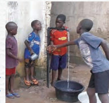
Providing water for orphanages in Benin