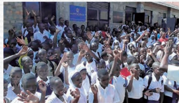
Reconstructing schools in Uganda with The Nelson Mandela Foundation