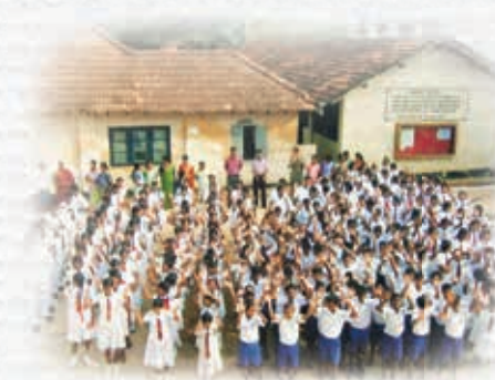
Rebuilding schools in Sri Lanka

Donation of mosquito nets for prevention of malaria to schools and hospitals in Uganda