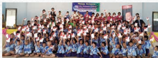
Donation of the books in Thailand

Donation to the area stricken by Typhoon in Mindanao, Philippines through Embassy of Philippines