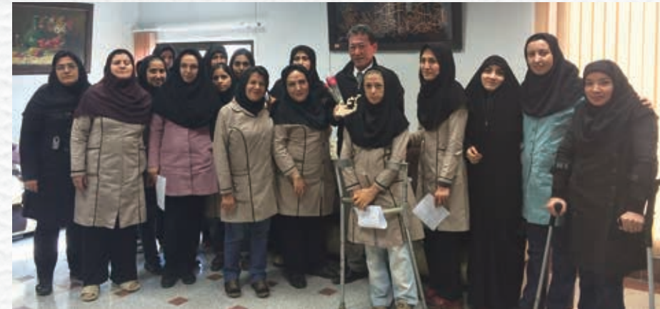
Charity workshop for people with disabilities through local charity foundation in Iran