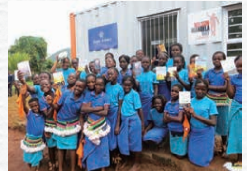
Constructing libraries in South Africa with The Nelson Mandela Foundation