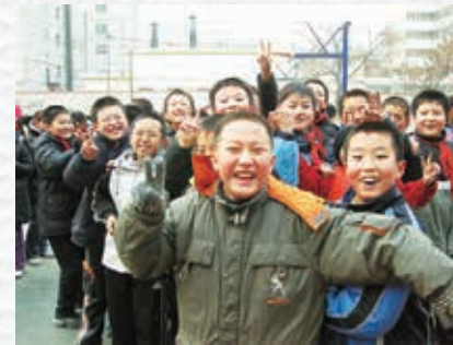
Book donations in China