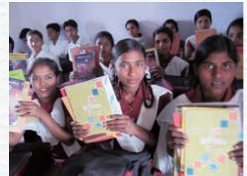
School support in Gaya, India