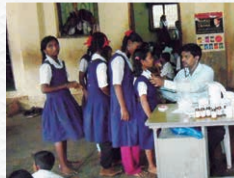
Medical support charity in Aurangabad, India