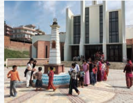
Disaster relief right after the earthquake in Nepal

Granting Scholarships for students of St.Mary Secondary School in Uganda