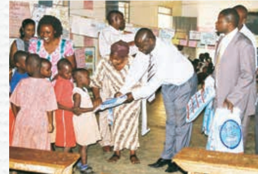
Mosquito nets in Uganda