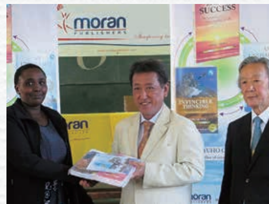
Donation of books appointed by Department of Education to 500 public high school in Kenya