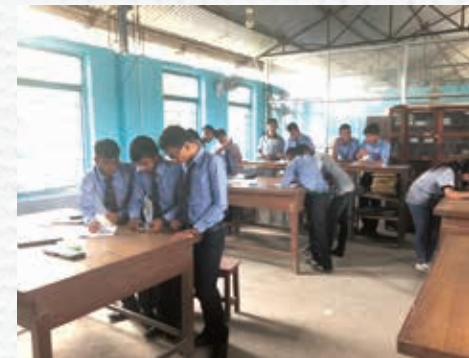
Donating laboratory equipment to the school after the earthquake