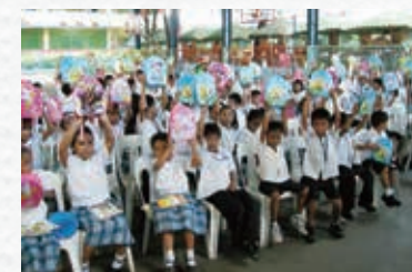
Charity in the Philippines