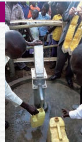
Construction of borehole in Northern Uganda

Donation of books appointed by Department of Education to 500 public high schools in Kenya